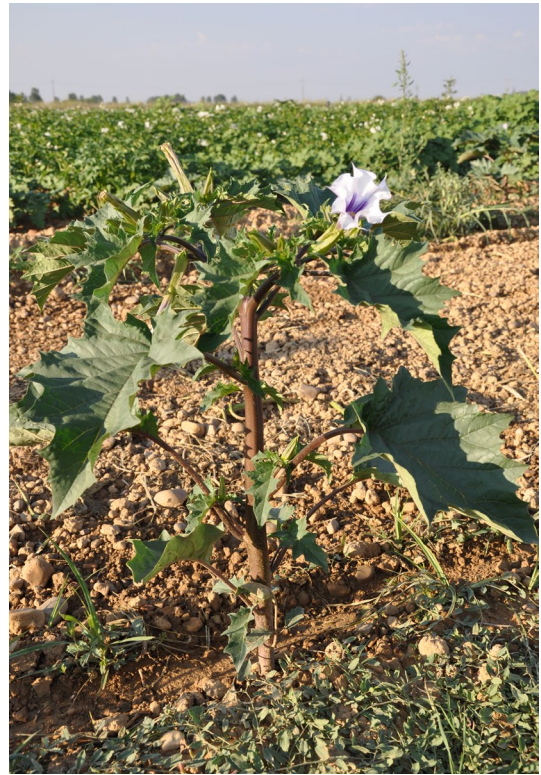
FIGURE 1 Reproductive plant of Datura stramonium in a cultivated field in the non-native range (Spain)

Populations of D. stramonium were sampled in 2010 and 2011. Fourteen and eight populations of Spain and Mexico, respectively,